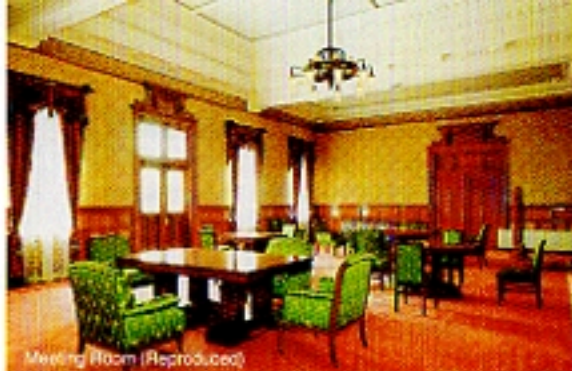
Meeting Room (Reproduced)

At the request of the citizens to forever preserve this building as a precious cultural heritage of Nagoya with its historical background and architectural beauty, the municipality of Nagoya had, assisted by the national government (Agency for Cultural Affairs) and the prefecture, performed preservative restoration and renovation of the building, and in 1989, re-conditioned it to start a new life as the Nagoya City Archives. The building is preserved and made open to the general public as an important cultural property of the nation, and houses the archives of Nagoya City. It stores and makes available to the general public the official documents and materials of the municipality issued from the birth of Nagoya City up to the present. The building also offers space for conferences, meetings and exhibitions as a place for citizens to gather.