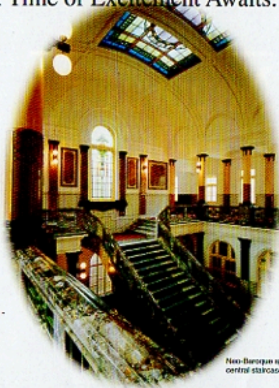
Neo-Baroque space central staircase

See the History. Feel the Culture. A Time of Excitement Awaits.