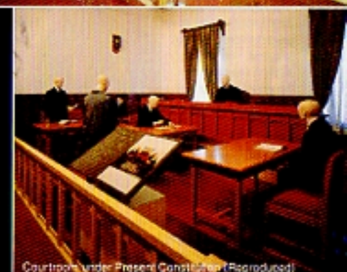
Courtroom under Present Constitution (Reproduced)

Important Cultural Property "Former Nagoya Court of Appeals Building" This building was designated as an Important Cultural Property because: ① this building is the oldest court of appeals building now existing, ② it is the last large-scale modern building constructed of bricks, ③ its appearance, central staircase and 3F meeting room have excellent architectural designs that depict the 19th-century Neo-Baroque style to the present, ④ it preserves advanced techniques involving stained glass, plastering, marble pattern plastering, etc. and ⑤ the structure combining bricks and reinforced concrete reveals the transition of modern building construction techniques.