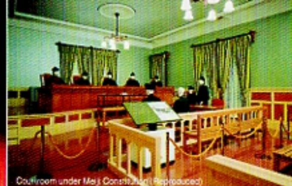
Courtroom under Meiji Constitution (Reproduced)