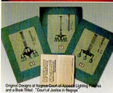
Original Designs of Nagoya Court of Appeals Lighting Fixtures and a Book Titled "Court of Justice in Nagoya"

Municipal Administration Documents Exhibition and Judicial Materials Exhibition Aside from the display of the architecture, the permanent exhibition rooms, in order for visitors to deepen their understanding of the Nagoya municipal administration, includes a municipal administration materials exhibition corner where the course of the history of Nagoya from its municipalization in 1889 up to the present is introduced and explained plainly, spotlighting it from the various angles of politics, economy, industry, culture, etc. and a judicial materials exhibition corner where the transition of our modern judicial system is introduced and explained for visitors to understand at a glance, reproducing courtrooms fitted with realistic atmospheres using dolls and old furniture.