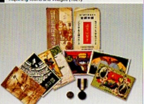
First Population Census Picture Postcard and Memorial Medal (1920)