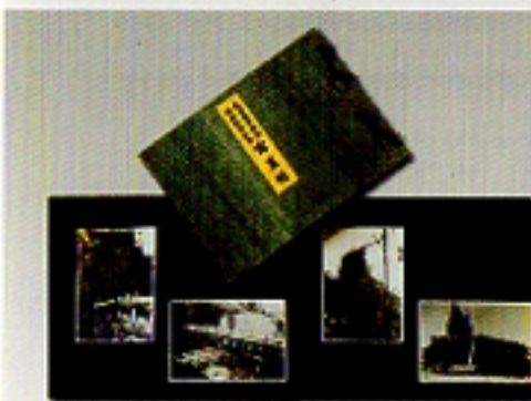
Nagoya City Hall Construction Completion Photographs (1933)