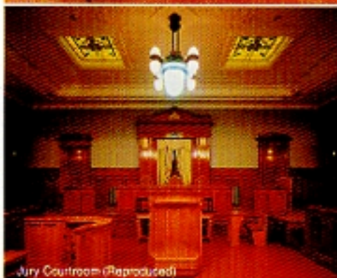
Jury Courtroom (Reproduced)

Important Cultural Property "Former Nagoya Court of Appeals Building" This building was designated as an Important Cultural Property because: ① this building is the oldest court of appeals building now existing, ② it is the last large-scale modern building constructed of bricks, ③ its appearance, central staircase and 3F meeting room have excellent architectural designs that depict the 19th-century Neo-Baroque style to the present, ④ it preserves advanced techniques involving stained glass, plastering, marble pattern plastering, etc. and ⑤ the structure combining bricks and reinforced concrete reveals the transition of modern building construction techniques.